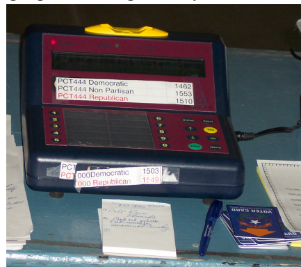
Figure 8. Card Activator labeling modified by poll worker to put provisional numbers out of the way.

One befuddled voter said, “The punch card was great,” and wanted a copy of his paper receipt. On the