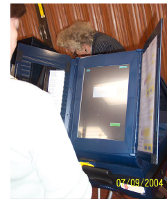
Figure 10. Official behind machine transcribes machine counts

When it came time to shut down the polls, two women worked together. They intended to each write down the readings so that they could check them. However, when the time came they forgot to do this and