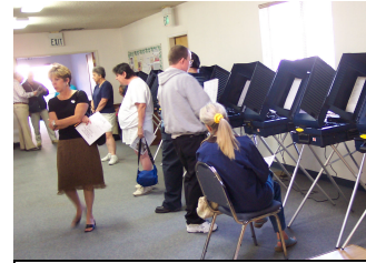
Figure 4. Voters who accidentally voted on provisional ballots.

Before leaving, I asked one of the exiting first voters, “Did you notice a second display?” trying to get him to tell me about the paper trail behind the glass. “No....,” the man replied, “I just voted and reviewed my selections on the screen.”