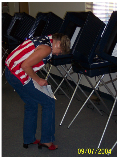
Figure 1 A lone Poll worker documenting the state of a machine at the beginning of the day]

We arrived one minute before the polls were scheduled to open. Poll workers were busy setting up registration desks and voter materials. However, the screens on the voting machines were black. A distressed poll worker moaned, “This was terrible. We weren’t able to get in here until 6:45 a.m.” Washoe County Registrar Dan Burke later explained that it is often a problem to get into polling places at 6:00 a.m. on the day after a holiday, as was the case in this election.