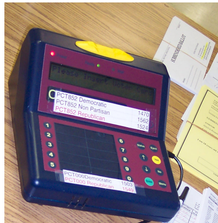
Figure 6. Activator box with paper labels for ballot codes.

A Sequoia representative had arrived in response to an earlier trouble-shooting call (laudably, he and other employees arrived within minutes whenever and wherever they were summoned). He denied that the machines operated differently on battery than when attached to an electrical outlet. He was convinced that the woman responsible for entering the codes for precinct 516 on voters’ cards had accidentally been typing in the code for a provisional ballot. In Reno provisional ballots (pct 0000) only allow voters to make selections for races available to every precinct, in this case senator. It was an easy mistake to make because the provisional ballot code was the one closest to the front of the activation box. [Figure 6] The list of precinct codes was posted farther up the card activator on another scrap of paper above the buttons. The poll worker seemed to realize her error at about the same time that the inactive power plug problem was solved. She must have then begun typing in the correct numbers but never admitted her mistake. When we offered this explanation to the polling manager, she agreed that it sounded more plausible than hers. I do not know, however, how she documented these incidents.