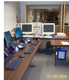
Figure 11. counting room adjoining public lobby.

I took interest in a memory module. He pointed out that it was just like the USB memory he had in his pocket. I noticed that the voting servers had slots for the memory cards and also extra USB connectors. I do not mean to imply that this well-meaning official had any nefarious intentions to defraud machines. However, the ease with which someone else might install a memory transfer device in the counting machines gave me a start. It was a particularly frightening end to a long day.