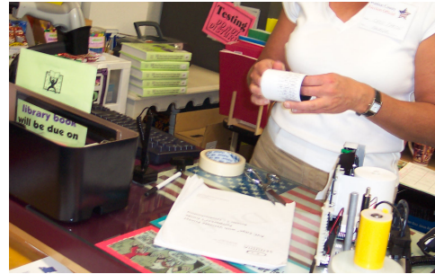
Figure 5. A poll worker holds paper trail “receipts” from that day’s election in a

When we arrived at the third polling place, a paper trail “receipt” printer stood open on a counter in front of us. “They told us to replace the paper if it jammed,” a poll worker explained. The instructions provided for her included nothing about how to rethread the paper (we were told that the instructions at some polling places did and at others didn’t) so she struggled to figure it out on her own. At first, she tore some paper off and tried to fit the end through the printer. Then, she grabbed a pair of scissors and cut more paper off the roll. As she did this, the paper trail “receipts” already recorded by the printer were cut off [Figure 5].