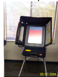
Figure 2. Voting machine in poor lighting situation.

It can only be seen if you bend down and over to look at it. However, in this polling place the voting machines were so close to the wall that it was probably impossible to check the power light easily. Indeed, a color band at the bottom of the touch screen appears when a machine is running on battery. This should have alerted election workers to the situation. Unfortunately, it went unnoticed.