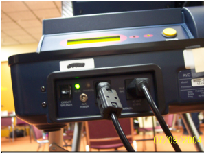
Figure 3. Back of voting machine with green indicator light.

In the midst of this chaos, a low battery message on one machine's screen, indicating that it was not plugged in and had run down its battery power, was overlooked. This particular machine was placed near a window, which flooded the screen with sunlight and made it difficult to read. [Figure 2] The oversight might also have been possible because the green indicator light, which confirms that a machine is correctly plugged in, is located at the very back of the machine under a ledge [Figure 3].