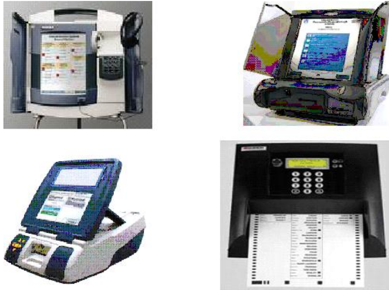
Fig. 1. The figure plots the different voting devices tested in the 2007 Colombia's e-voting pilot: Prototype 1 (upper left), Prototype 2 (upper right), Prototype 3 (lower left) and Prototype 4 (lower right).

sample. In fact, a large majority of the participants in the test had very high education levels compared to the average Colombian population. This, together with the fact that participation was voluntary, limits the possibility of generalizing the results presented in this paper to the overall voting population and underscores the need to conduct further tests in alternative locations and with a more heterogeneous subject pool. However, given that participants in each experimental site were randomly distributed across prototypes, there was no systematic relationship between voters' personal characteristics in each location and the prototype assignment, and thus these problems do not invalidate the internal (i.e., in-sample) validity of our results. 11 Moreover, our randomized research design mitigates some concerns that have plagued previous studies in this area, such as vote tampering, differential turnout rates, and self-selection into different voting technologies [17], [29]. 12